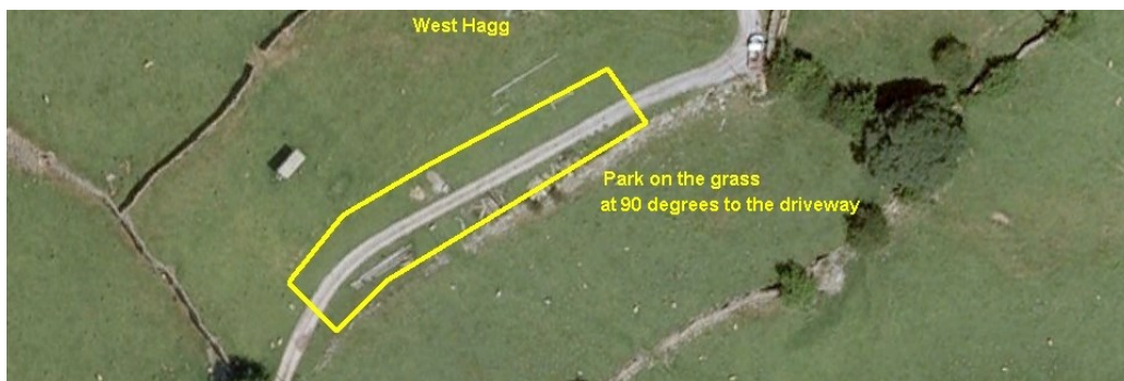
Walking Route to Dig Site