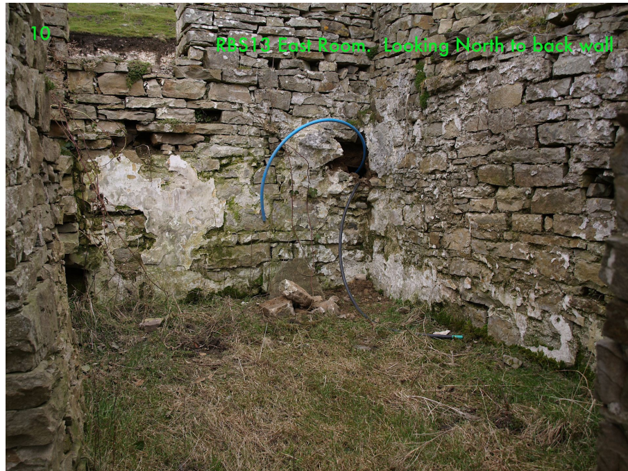
Figure 3: East Room before excavation