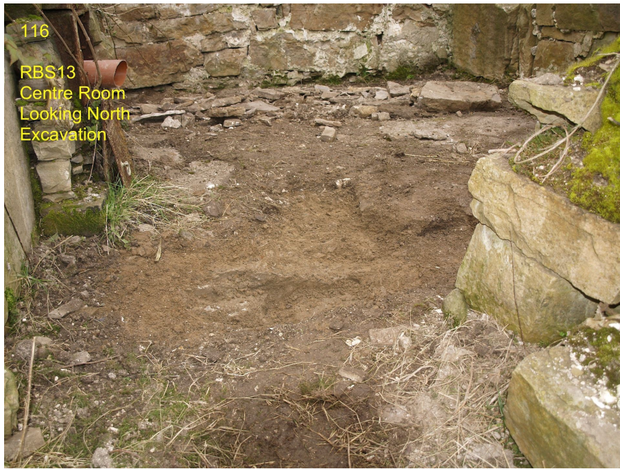
Figure 9: Excavation of Centre Room