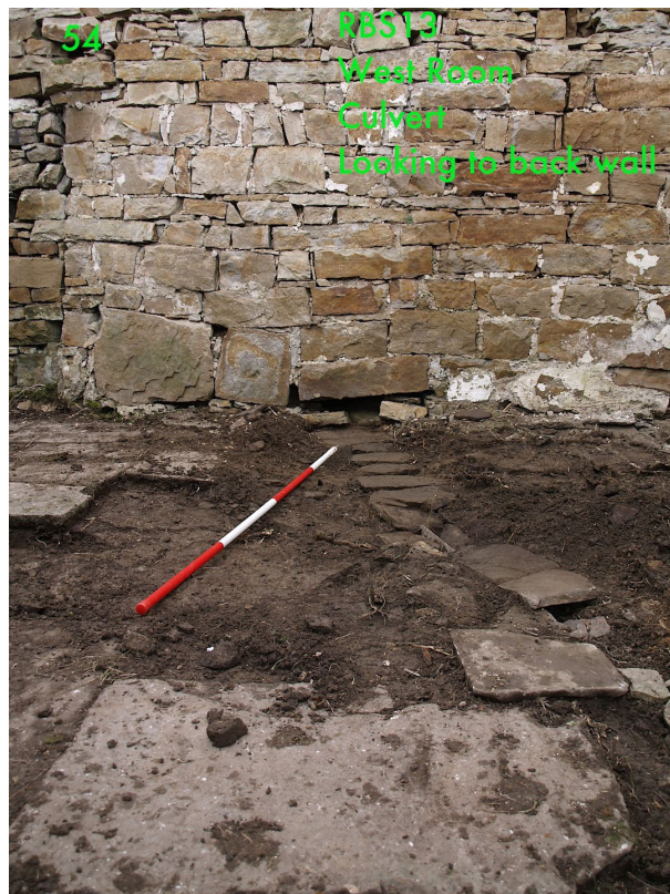
Figure 6: West Room showing culvert