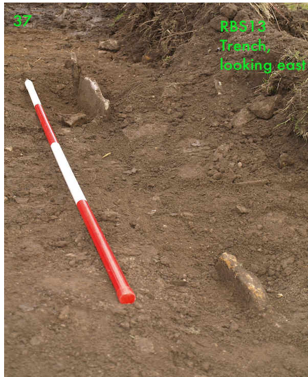
Figure 5: Trench showing the vertical slabs