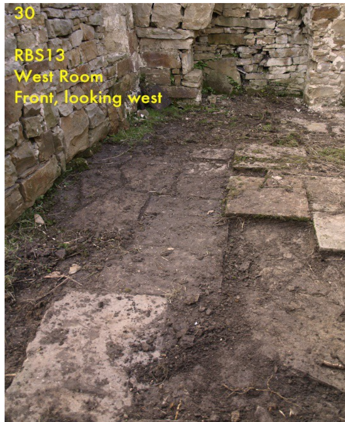
Figure 11: West room. Door on left, lip between old and new flags