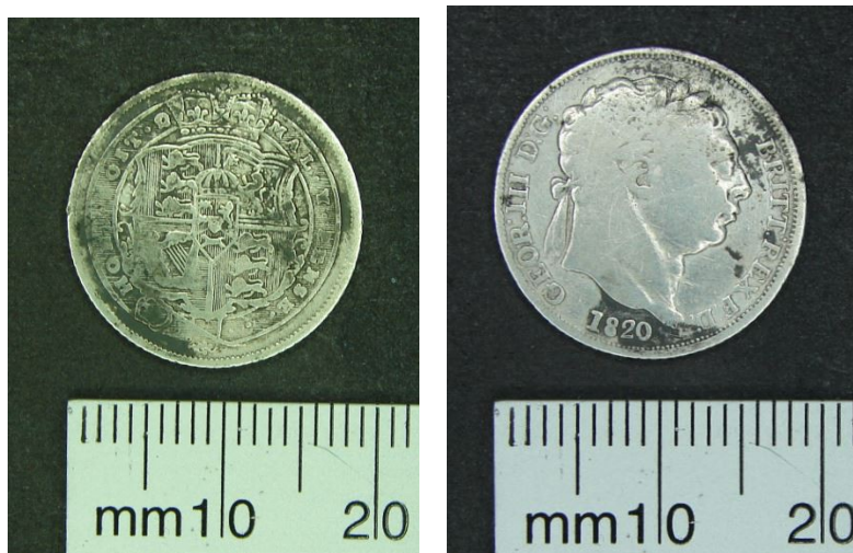
Figure 13: George III silver sixpence [105] <1>