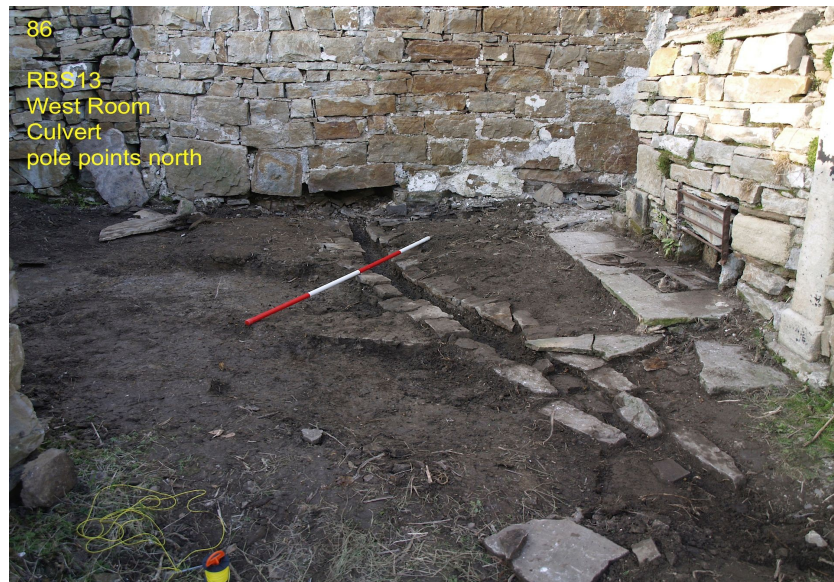
Figure 8: West Room, showing culvert