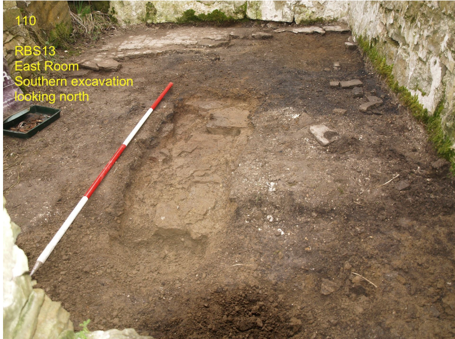
Figure 10: Excavation of East Room