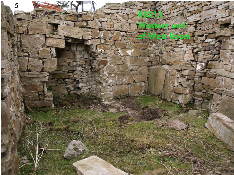
Figure 1: West Room before excavation