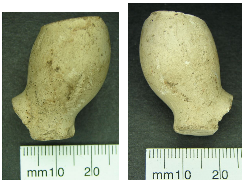
Figure 14: Clay tobacco pipe bowl [105] <2>