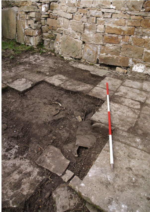
Figure 7: West Room, top layer of flags cleaned back