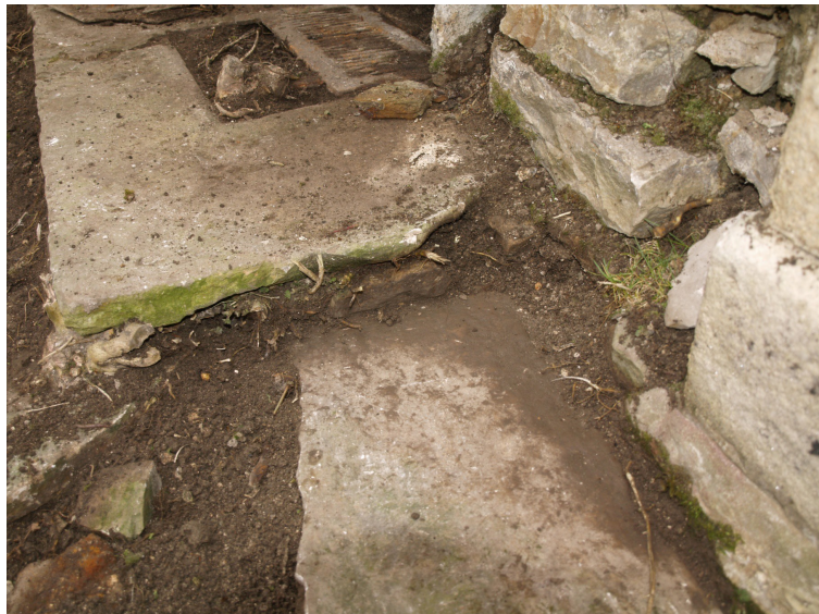
Figure 12: West room. Shows different contexts around fireplace.