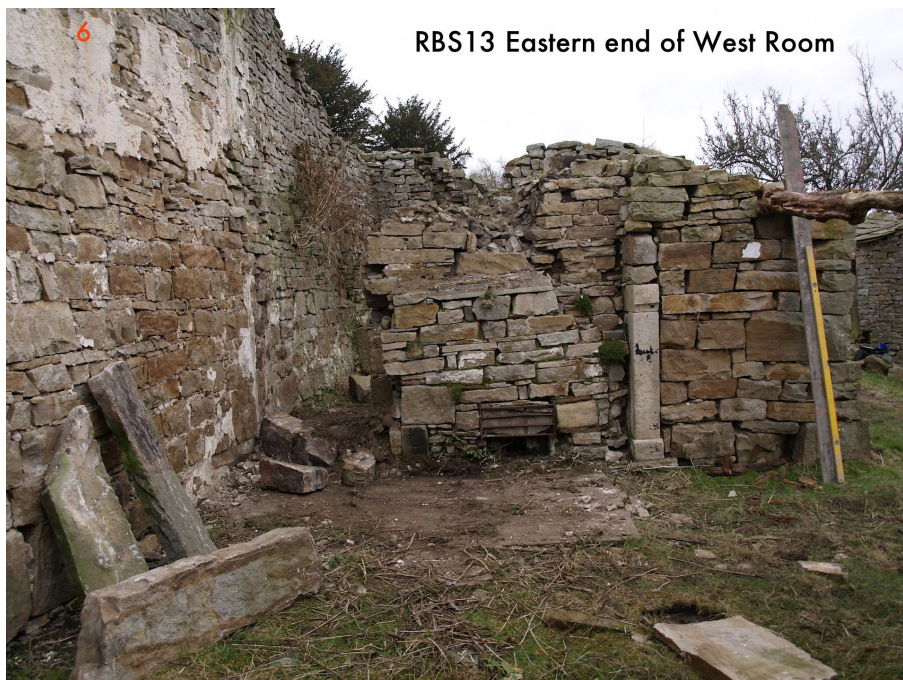
Fig 2: West Room before excavation