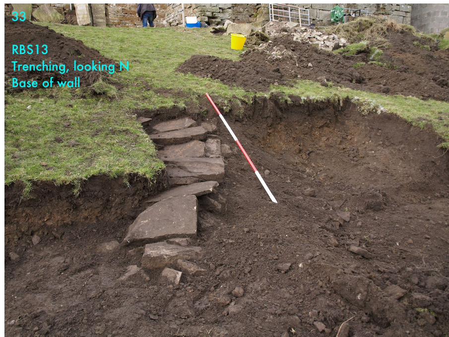
Figure 4: Base of field wall in trench