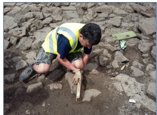
Photos: Threshold of the round house, raising the large slab, excavation of a quern stone