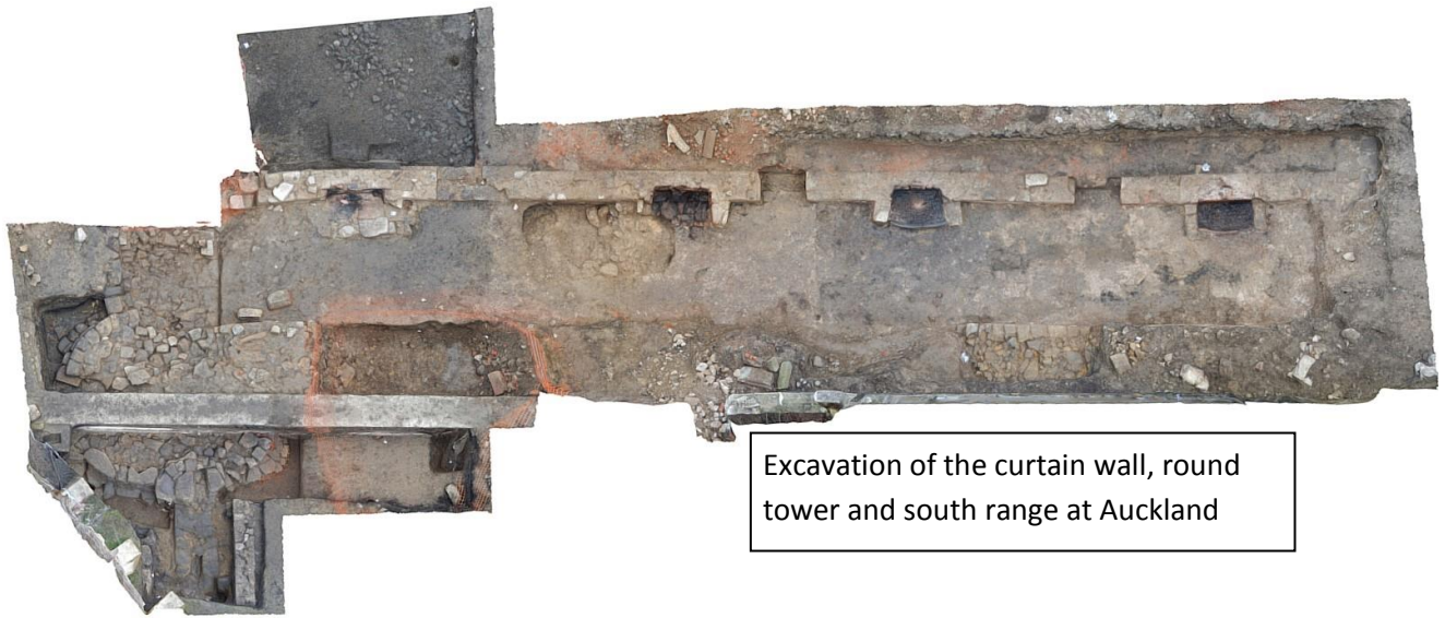
Excavation of the curtain wall, round tower and south range at Auckland

Stephen suggests that anyone who wishes to gain experience in excavating different periods and geographical sites could look at the websites of 'The Architectural and Archaeological Society of Durham and Northumberland (AASDN)' and 'Altogether Archaeology'.