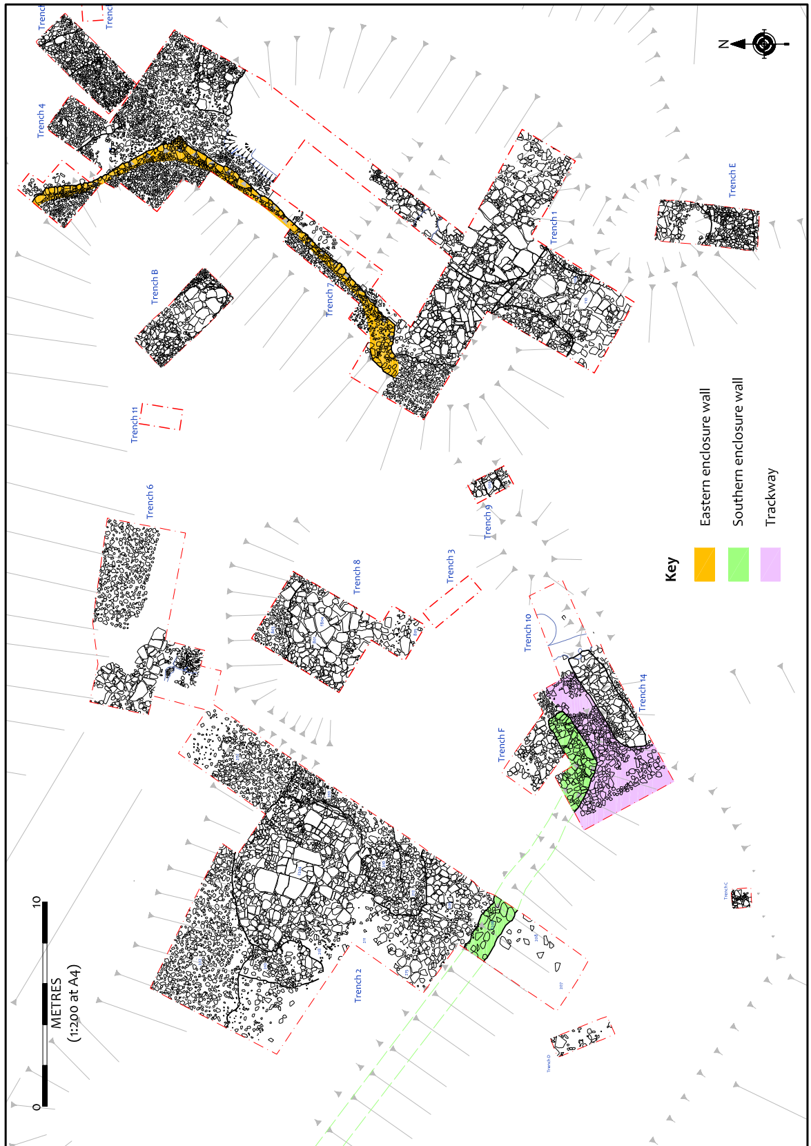
Figure 1: Site 103 showing excavated areas and features